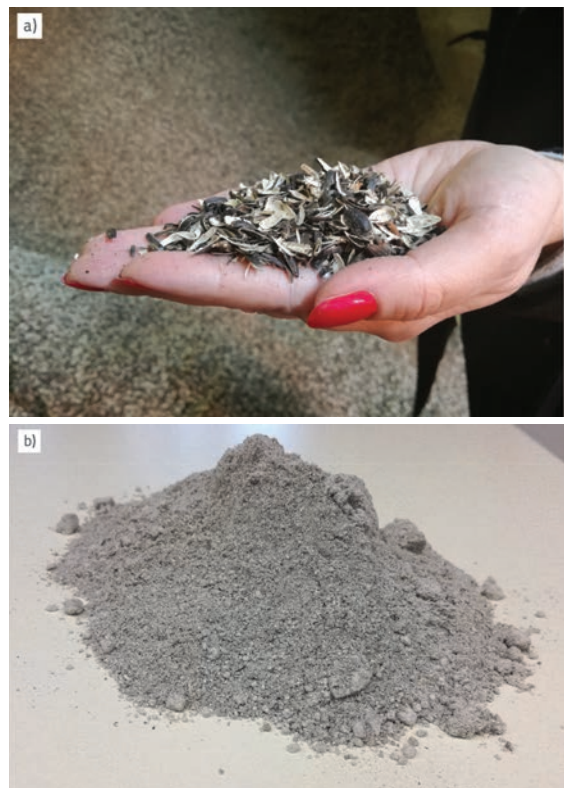
Figure 3. a) Sunflower seed hull; b) bioash from combustion of sunflower seed hull

The use of ash produced in Croatia in mortars was tested using ash generated through combustion of forest and wood waste in grate furnaces of the Lika Eko-Energo plant [4]. Coarse fly ash was used in mortar production as partial replacement of cement and sand (the proportion of ash ranged from 0 to 30 %). However, although the ash used contains clinker minerals, suggesting that it can be used in the cement replacement, it did not meet the requirements specified in EN 450-1 for the application of fly ash in concrete [31]. Reasons for that are excessively large particles, insufficient amount of pozzolanic oxides ( \text{SiO}_2 , \text{Al}_2\text{O}_3 i \text{Fe}_2\text{O}_3 ), and high amounts of alkaline metals and reactive \text{CaO} and \text{MgO} . These properties could be improved by pre-washing and mechanical treatment of bioash. In the mortars tested, an increase in cement replacement had a negative effect on hydration mechanisms, and it significantly reduced the workability, compressive strength and flexural strength. However, mortars with 5 % cement replacement and 3.3 % sand replacement fulfilled the requirements for use in structural mortars and concrete.