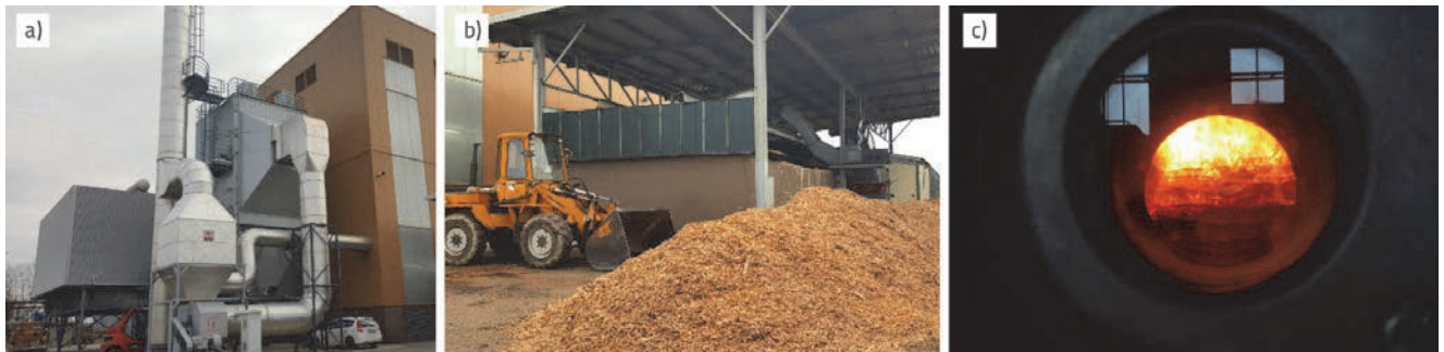
Figure 2. a) First private biomass power plant in Croatia; b) woodchips used, c) combustion of biomass [55]

(determined solely by ash or eluate analysis), its possible use must be carefully analysed and determined, and any potential harmful effects should be tested on mixtures.